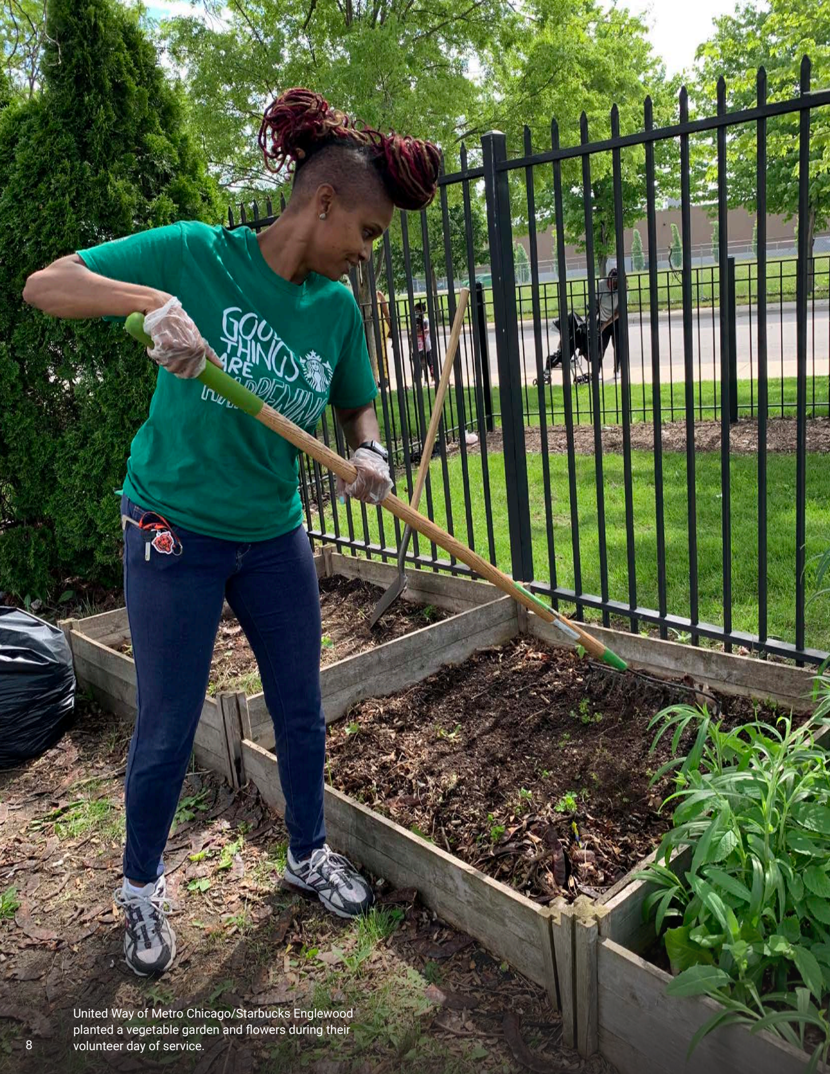
United Way of Metro Chicago/Starbucks Englewood planted a vegetable garden and flowers during their volunteer day of service.