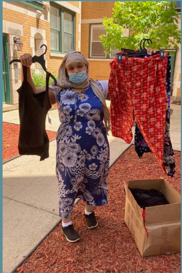
Austin Interim Housing resident showing off the beautiful clothes from CC’s Wish List.