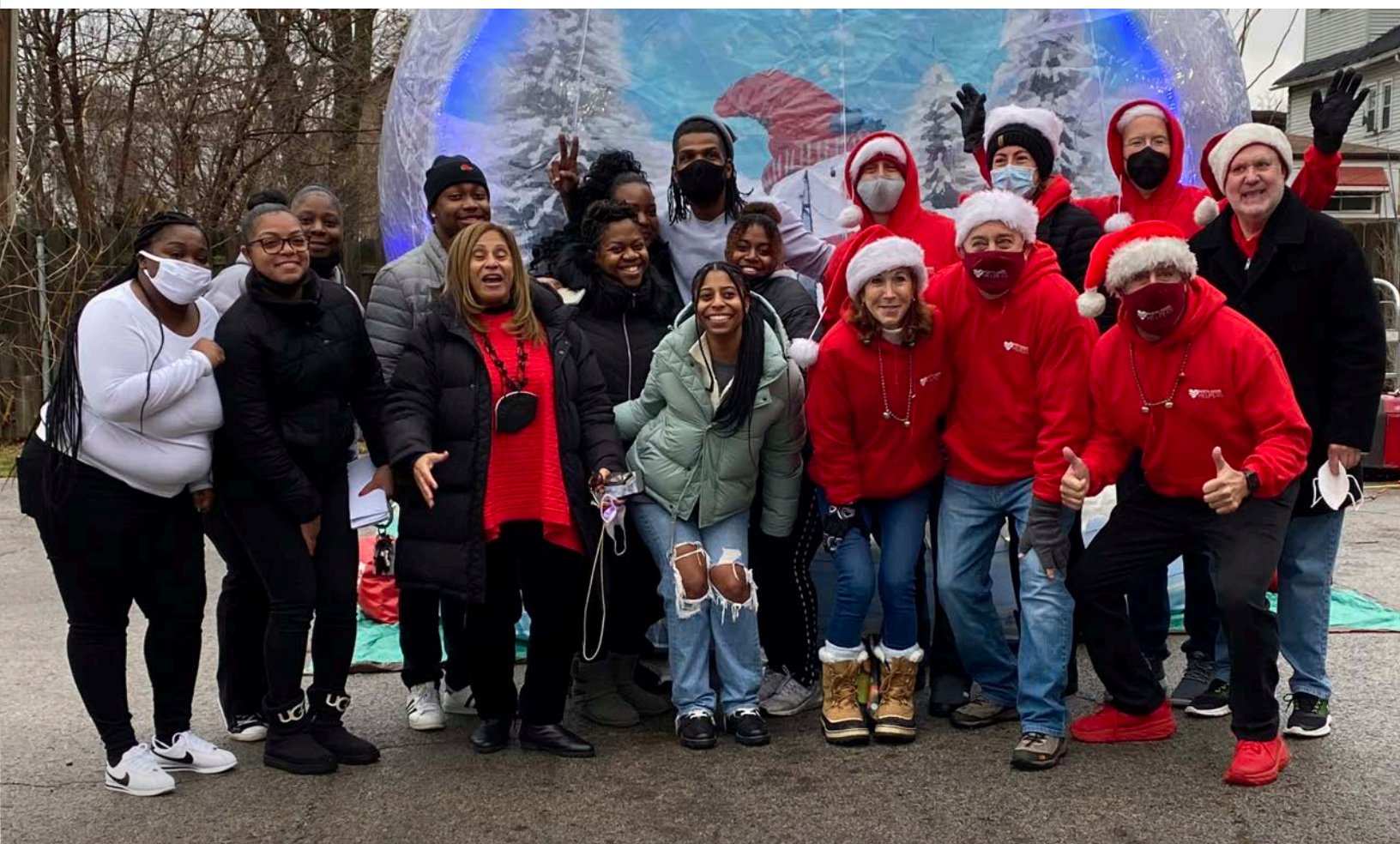
North Shore Helpers brings tons of smiles and holiday cheer to our families even during the Covid pandemic!